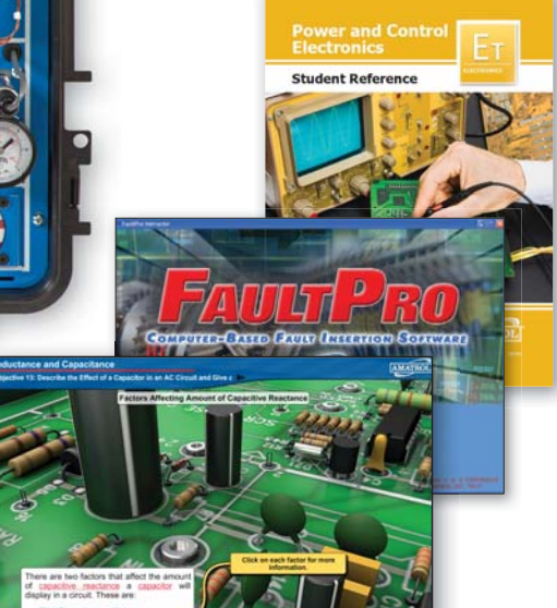
Interactive Multimedia, FaultPro, and Student Reference Guide