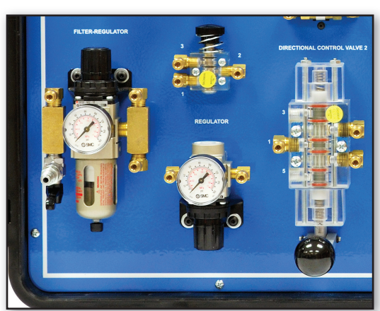
Air Filter on the 990-PN1

Because air is filled with dirt, pollen, and water vapor, pneumatic equipment may experience rusted pipes, worn parts, and broken seals if not properly and carefully maintained. On the 990-PN1, learners will study common sources of contamination, the importance of dew points and