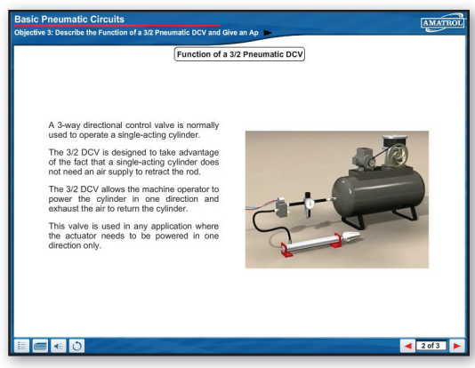
3/2 DCV in 990-PN1's Multimedia

As a specific example, learners will study the components, operation, schematic symbol, and applications of a 3/2 pneumatic directional control valve (DCV). Learners then implement this theoretical knowledge by practicing the handson skill of using a 3/2 manually-operated DCV to operate a single-acting pneumatic cylinder. The 990-PN1 utilizes industrystandard pneumatic components to familiarize learners with equipment they'll encounter on job sites.