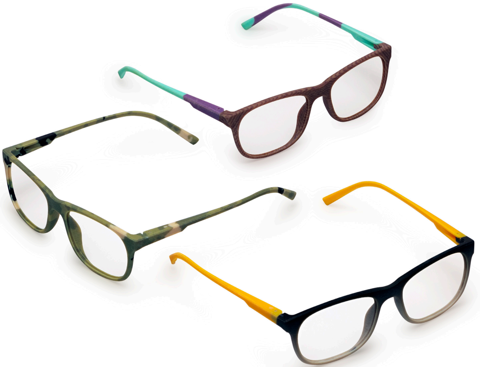
3D printed eyewear prototypes.