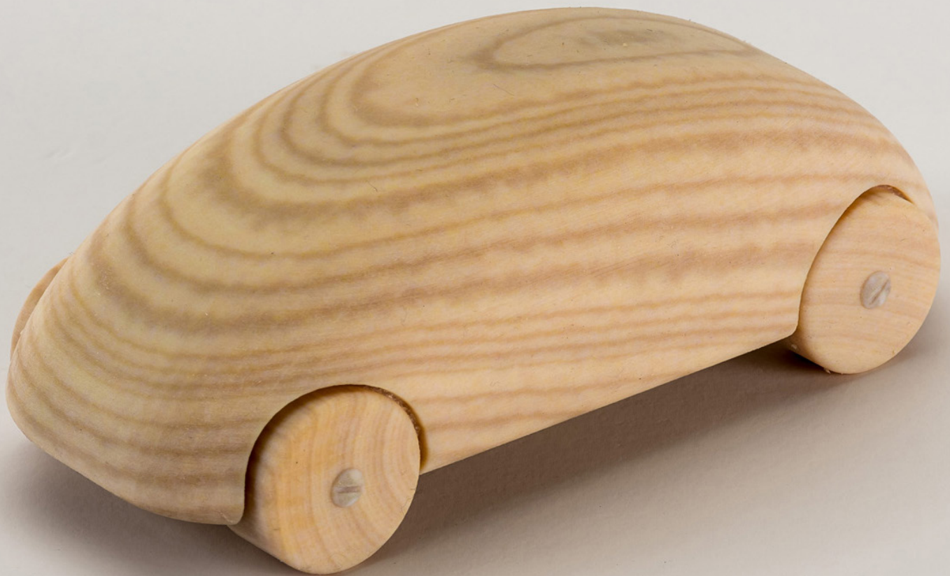
Luxion KeyShot Occluded Plane Toy Car 3D Printed on Stratasys J55.

With GrabCAD Print, designers have access to a simple, efficient PolyJet workflow that brings designs to life. Whether they incorporate bump mapping, color gradients, complex surface textures, or colorful graphics, design concepts can become reality in just a few clicks.