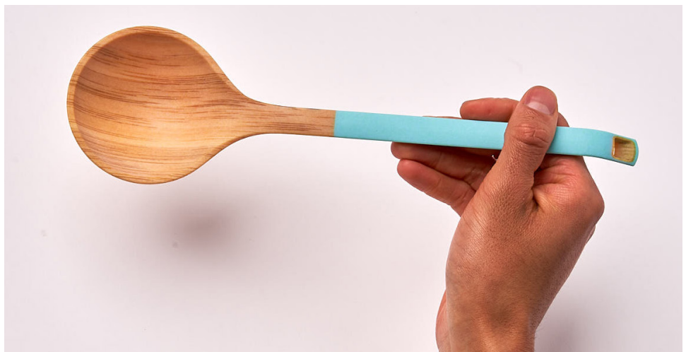
Go from KeyShot to GrabCAD Print in seconds with 3MF export.