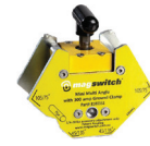
(1) Mini Multi Angle