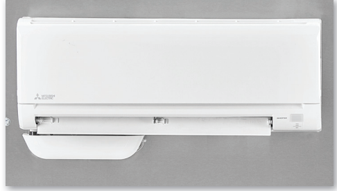
Real industrial components give learners hands-on experience

When it comes to learning important residential mini-split heat pump system skills, there's simply no substitute for hands-on experience with real equipment that technicians will encounter on the job. That's why Amatrol's Residential Mini-Split Heat Pump Learning System features real industrial HVACR equipment, including a heat pump condenser, evaporator unit, and condensate pump. The T7130 was also designed to include transparent housings and pipes with LED illumination that allows learners to see inside the system.