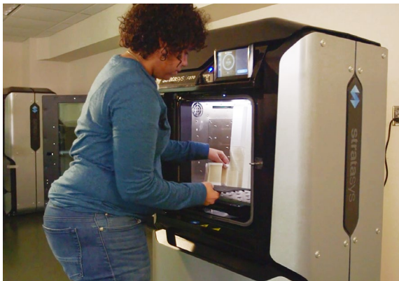
Accurate and reliable 3D printing helps students test their innovative ideas quickly.

Hands-on coursework includes weed whip and golf putter design projects that teach students manufacturing processes. Students also learn how to leverage 3D printing during the product development process by verifying concepts, validating designs and testing.