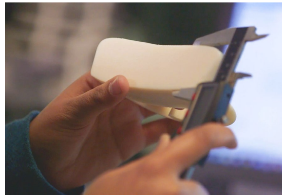
Students verify and refine their product designs with accurate, durable 3D printed prototypes.