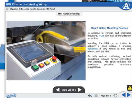
Multimedia Curriculum and Student Reference Guide