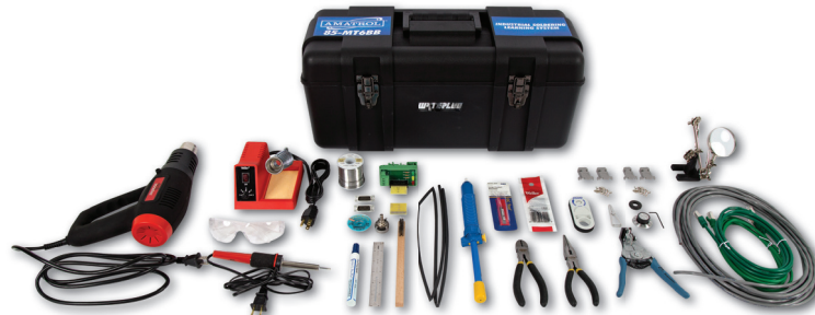
Industrial Soldering Learning System (85-MT6BB)

In addition to the Ethernet and Analog Wiring and VFD/PLC Wiring systems, Amatrol offers a third expansion system: Industrial Soldering (85-MT6BB). This system covers industrial soldering techniques commonly used within a control enclosure by industrial maintenance technicians.