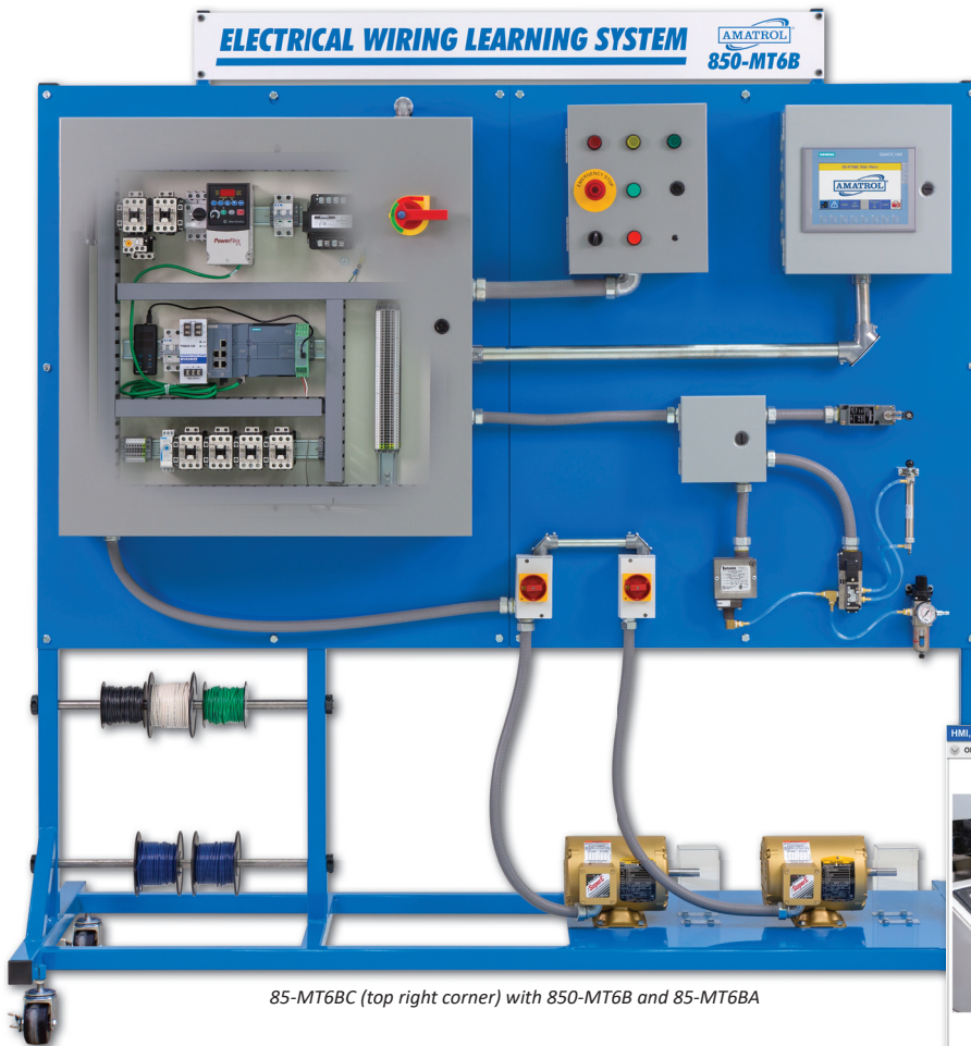
85-MT6BC (top right corner) with 850-MT6B and 85-MT6BA