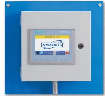
Siemens HMI Panel Installed on the Electrical Wiring System

This system includes a variety of real-world industrial components like a Siemens HMI panel, Ethernet switch and cable, analog transmitter unit, thermocouple, cooling fan, and a conduit set. When used with the Electrical Wiring and VFD/PLC Wiring systems, learners will practice hands-on skills like wiring and testing an Ethernet switch and HMI panel ground and power circuits, interfacing a transmitter to an analog input, and constructing and testing a Cat 5 Ethernet cable.