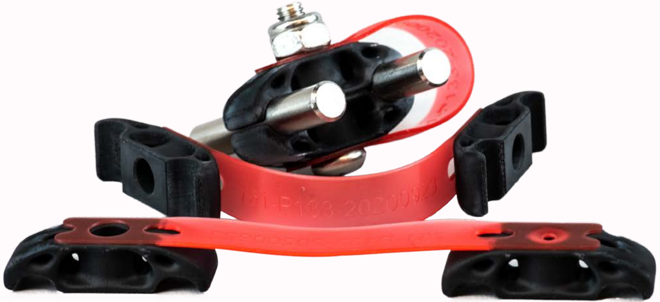
Final clamp revision with a printed-on elastomer tether for ease of installation.