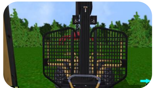
Unloading logs from the forwarder cradle to a target on the ground