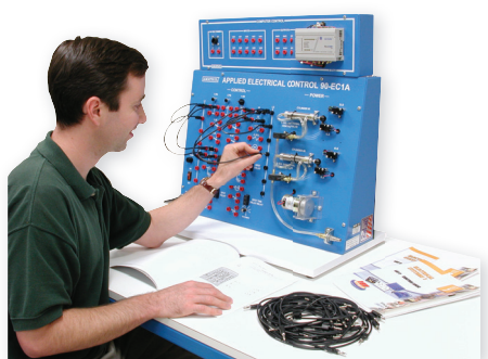
90-EC1-A with 90-CT1

The 90-EC1-A features numerous real-world components including DPDT relays, double-acting cylinders, limit switches, pushbuttons, accelerator switches, and solenoid operator valves. Learners use these components mounted on a tabletop, 18 gauge steel workstation to practice hands-on skills such as connecting and operating logic control circuits to energize fluid-power actuators and an electric motor. A timer relay and limit switches are used to provide sequencing control.